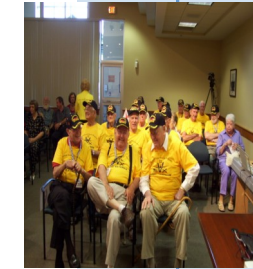
Baldwin County Commission recognized and honored the distinguished World War II veterans who traveled to Washington DC

For more information about county services, to search our knowledgebase or public records, place a request for service or get answers to frequently asked questions visit: