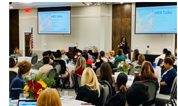
WOMEN LEADING GOVERNMENT CONFERENCE