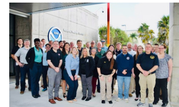
VISIT TO THE NATIONAL HURRICANE CENTER