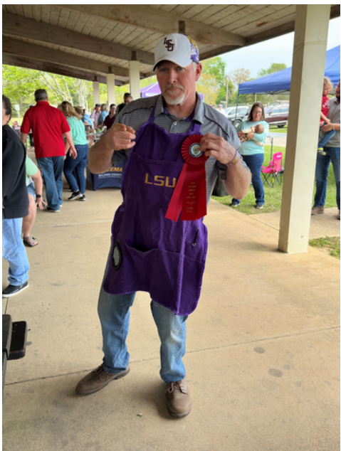
2nd Place Overall Winner: Council on Aging