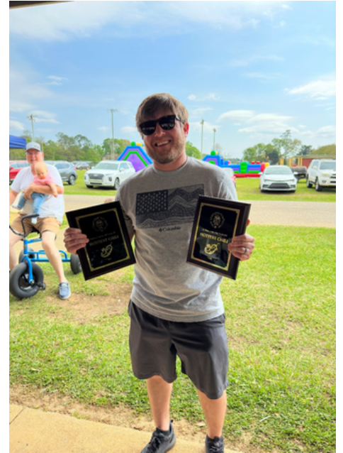
Hottest Winner: Building Inspection (2nd Year Win!)