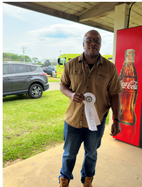
3rd Place Overall Winner: EMA