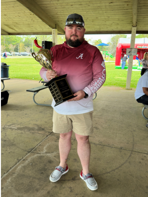
Overall Winner: Highway