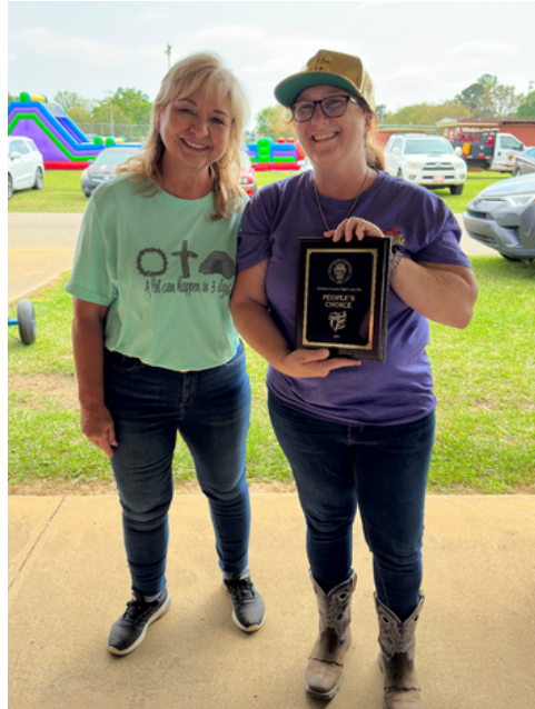
Peoples Choice Winner: BRATS